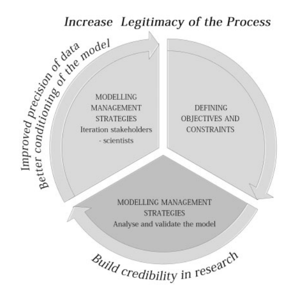
Figure 3. Diagram of the stakeholder engagement phases and main qualitative results of the participatory process to develop a bioeconomic model for Cantábrico-Noroeste fisheries.

Distance to F<sub>MSY</sub> and discards for hake stock in different management scenarios. The scenarios shown in the table, apart from the status quo scenario, are based on the combination of the options for the HCR using the multi-stock (MultiRP) and single-stock (SingleRP) approaches to MSY, with and without LO and with Artisanal effort being constant or not.